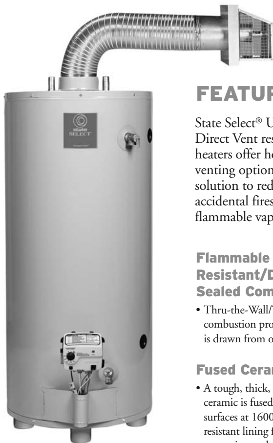
Image Shows Model GS6 40 UBDS L