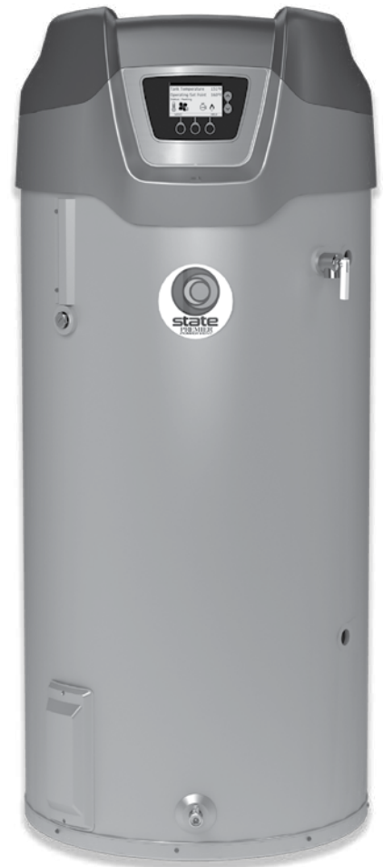
MODEL SHOWN GPG 75 SERIES 140/141

*Model GP6 50 4.31 GPM continuous flow, based on 65°F inlet water temperature, 110°F outlet temperature.