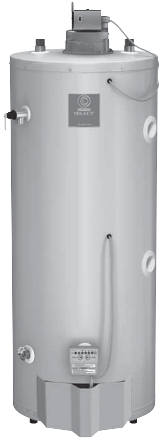
Image Shows Model GS675 URRBS