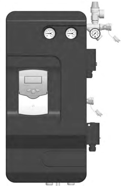
Double Wall Pump Station