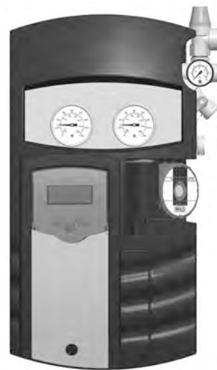
Standard Pump Station