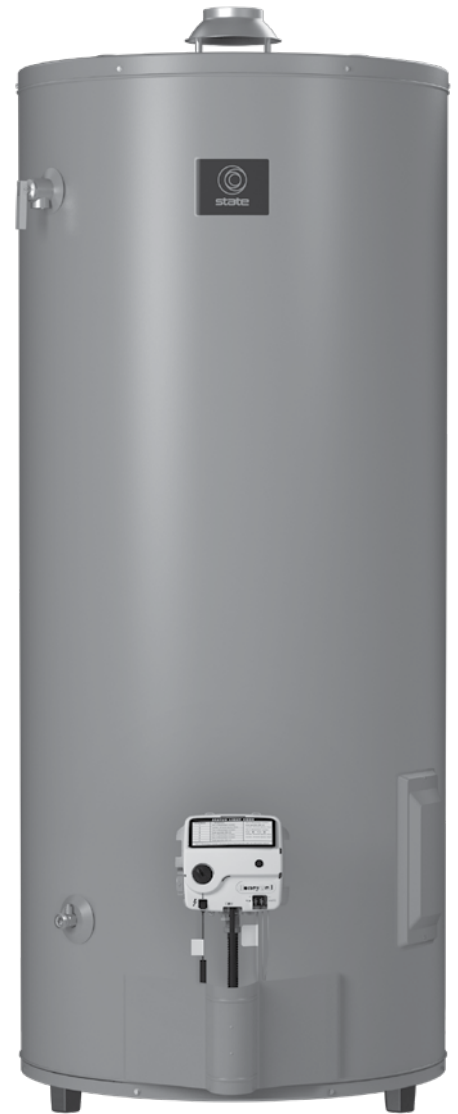
SBS75 & SBS100