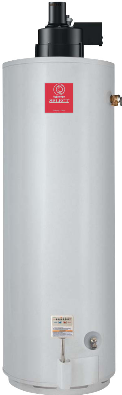
200 Series Model

6-Year Tank Warranty • 6-Year Parts Warranty