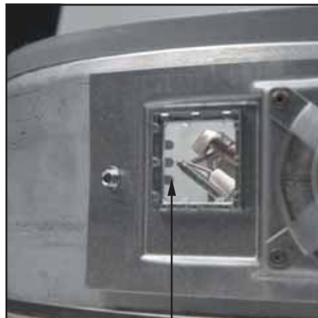
View Port Allows For Easy Burner and Pilot Inspection.