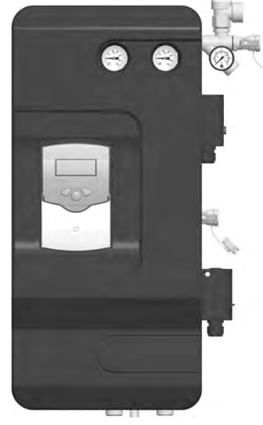
Double Wall Pump Station