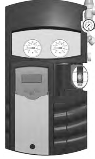
Standard Pump Station