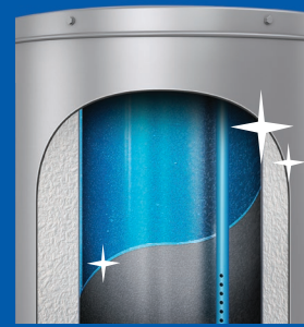
Blue Diamond® Glass Coating