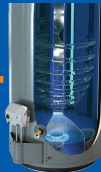
DynaClean™ Automatic Sediment Cleaning System