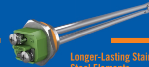
Longer-Lasting Stainless Steel Elements