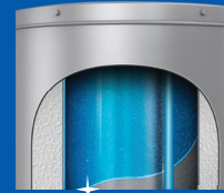
Blue Diamond® Glass Coating