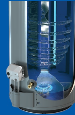
DynaClean™ Automatic Sediment Cleaning System