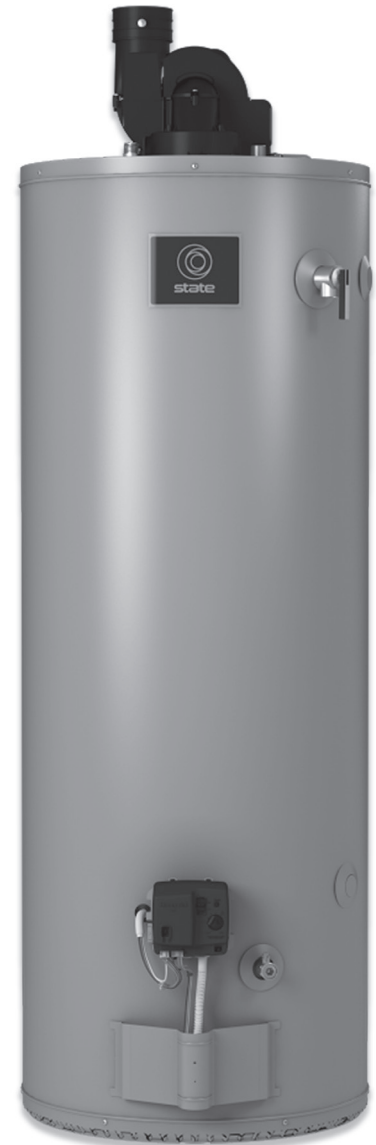
SDV75 76 SERIES 210/211