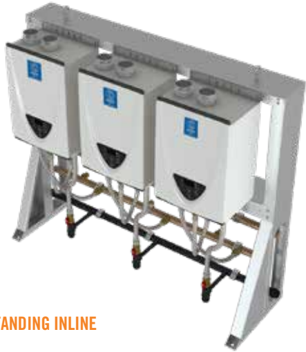
FREE STANDING INLINE