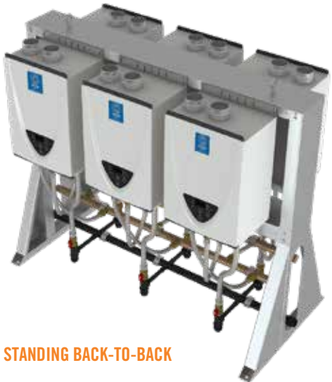
FREE STANDING BACK-TO-BACK

The State Commercial Tankless Rack System is designed to give you all of the benefits of tankless water heaters in an easy-to-install package. The racks are available in a variety of configurations with up to 1,194,000 BTU on a single rack system. They feature our 199,000 BTU high efficiency condensing tankless heater for significant energy cost savings. The systems are pre-assembled, and only require three simple connections - cold water, hot water, and gas.